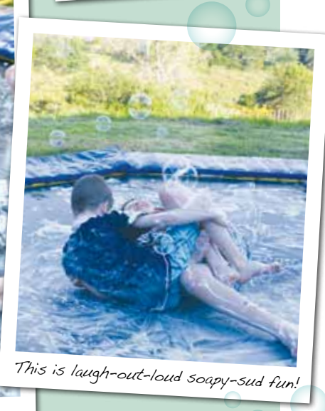
This is laugh-out-loud soapy-sud fun!