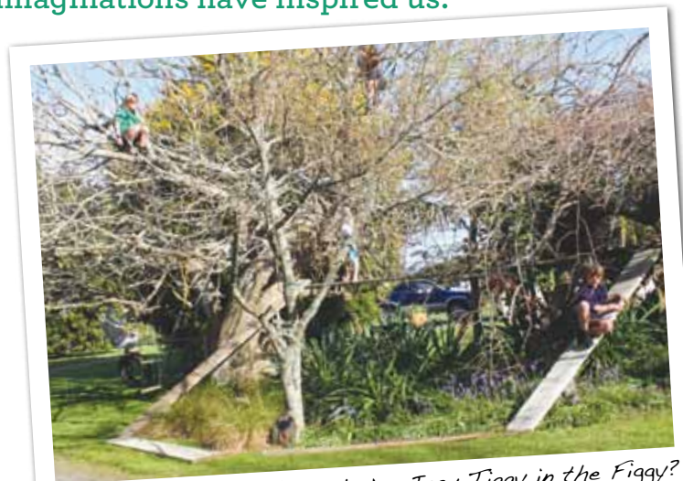
Can you spot five kids playing Iggy Tiggy in the Figgy?